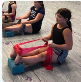
Stretch & Strength Private Lessons