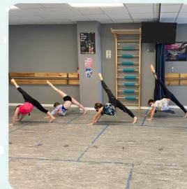
Small Group Training

PLATINUM PERFORMANCE DANCE ACADEMY 516.308.7055 WWW.PLATINUMPERFORMANCEDANCE.COM