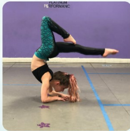
Acro/Tumbling Private Lessons